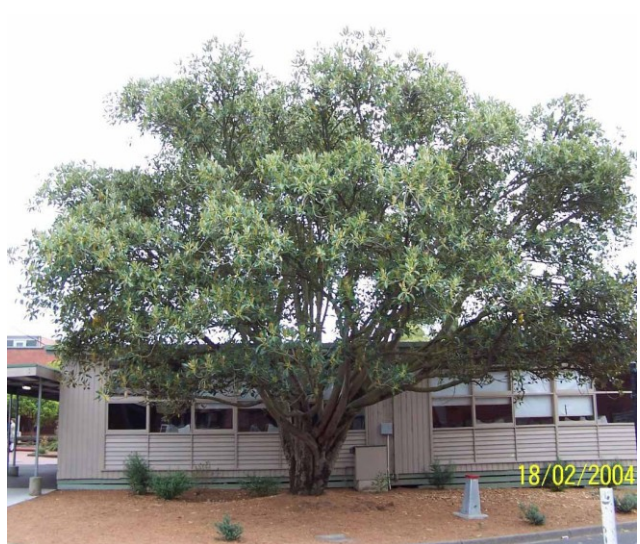
After: New and vigorous growth increased leaf mass.

Acknowledgments: Ian W. Smith Forest Science Centre for diagnosis fact sheet.