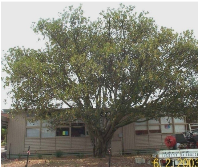
Before: At treatment micro injection with systemics