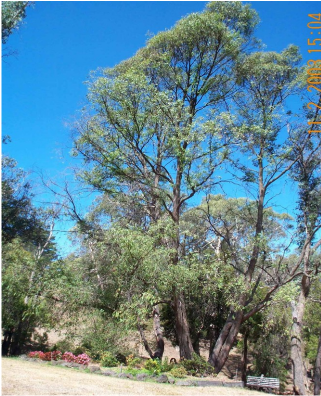
Before: 2003 Treatment with micro injection.