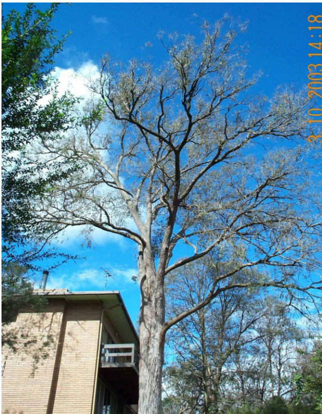
Before: Micro-injected on, October 3rd 2003.

Zoospores and Mycelium can spread with dirt on shoes or implements, care must be taken when entering areas such as nurseries etc. Click on link for further information