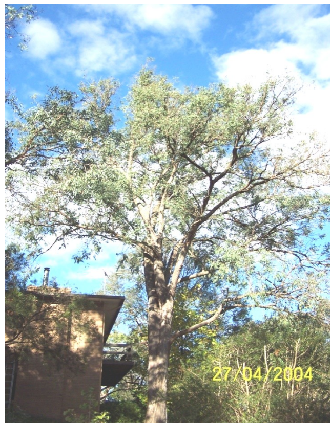
After: Rapid recovery is evident by April 27 th 2004

Environmental Tree Technologies guarantees its tree injection treatments for two years or more in multi species amenity trees. Our treatments can also incorporate micro nutrients, elicitors and chelates with the fungicide further enhancing the outcome.