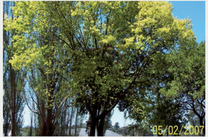
Update: Late in the Fourth Growth Season.