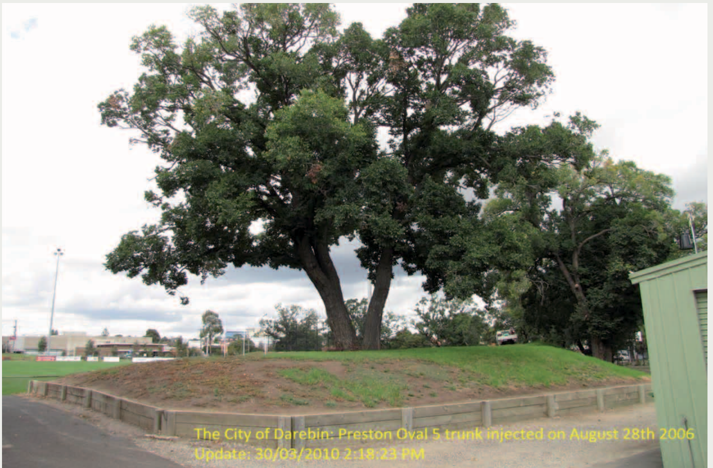
The City of Darebin: Preston Oval 5 trunk injected on August 28th 2006 Update: 30/03/2010 2:18:23 PM