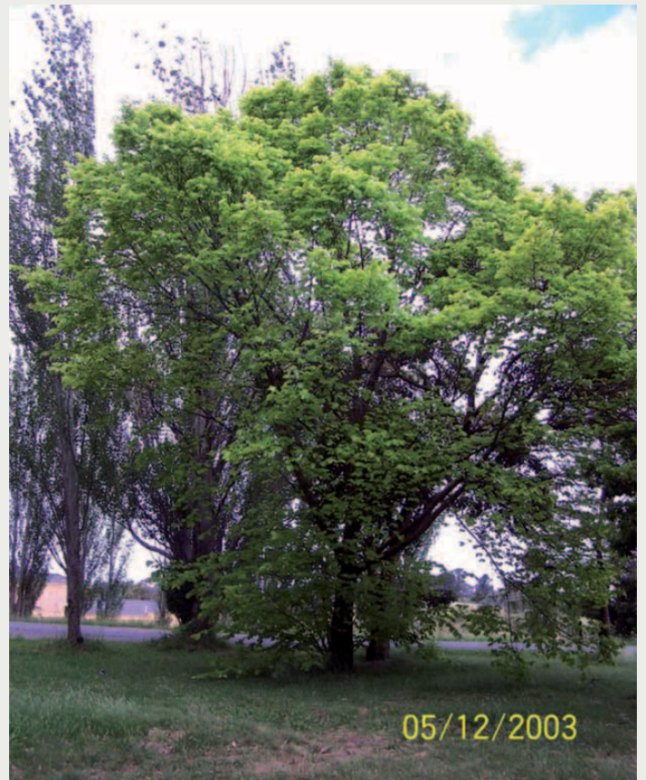
One Month On: Tree is clean with no larvae