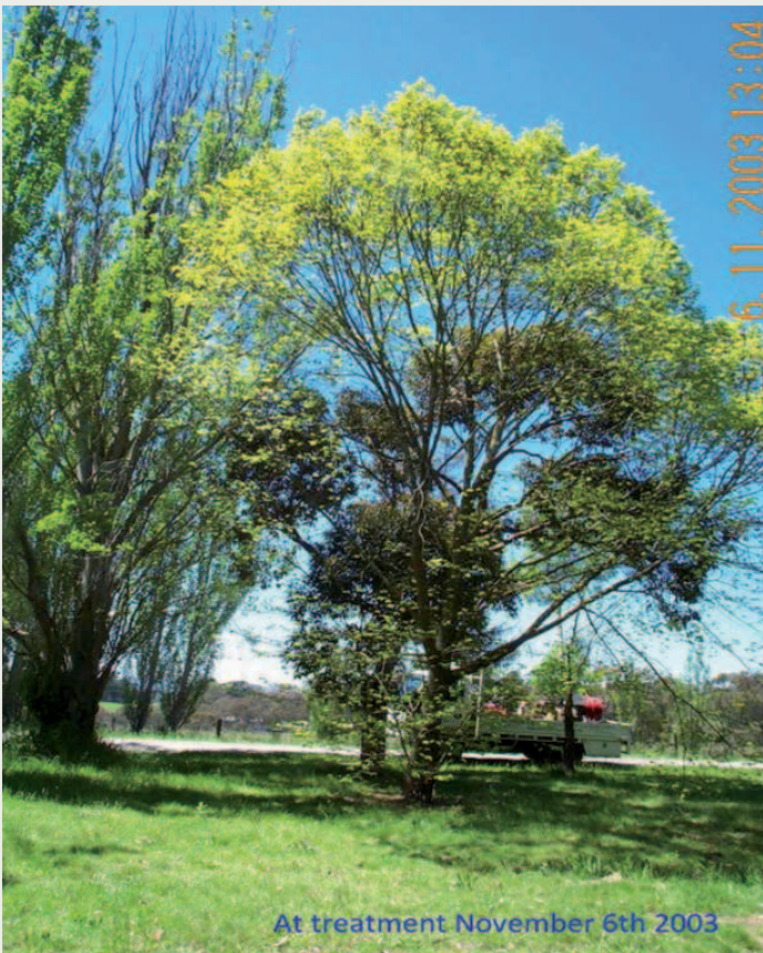
At treatment: injected November 6th 2003