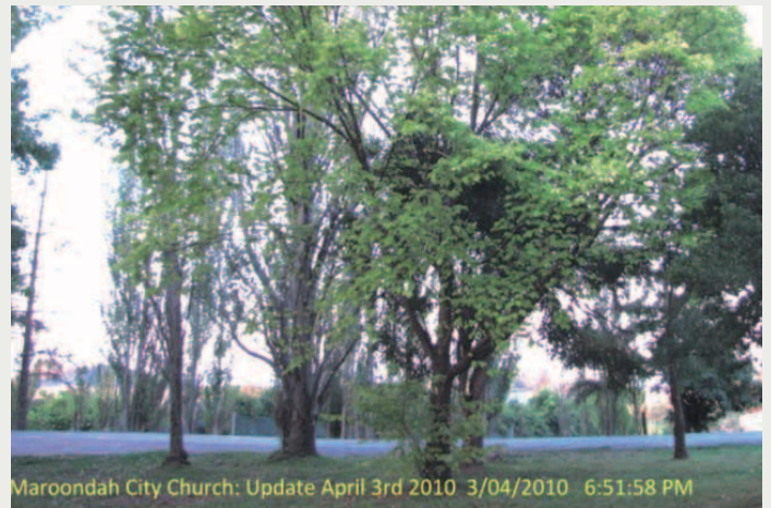
Update: Late in the Seventh Growth Season.