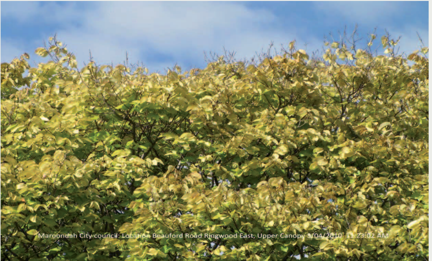
2010 Close up. Heavy beetle pressure and some larval damage due to a decline in chemistry levels.