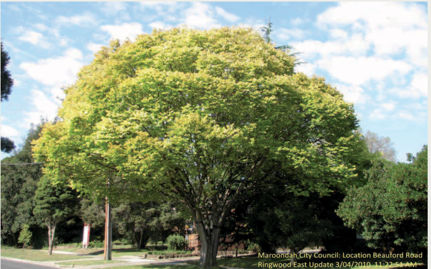
Excellent control right up to the Fifth growth season, reasonably good result can be expected into the sixth growth season. We will treat this tree again in late Autumn 2010, as it will fail next season