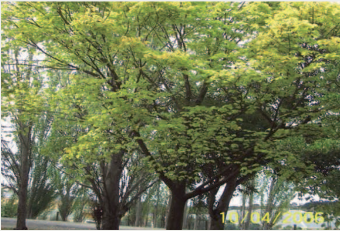
Update: Late in Third Growth Season