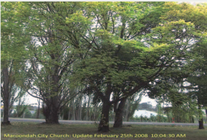
Update: Late in the Fifth Growth Season.