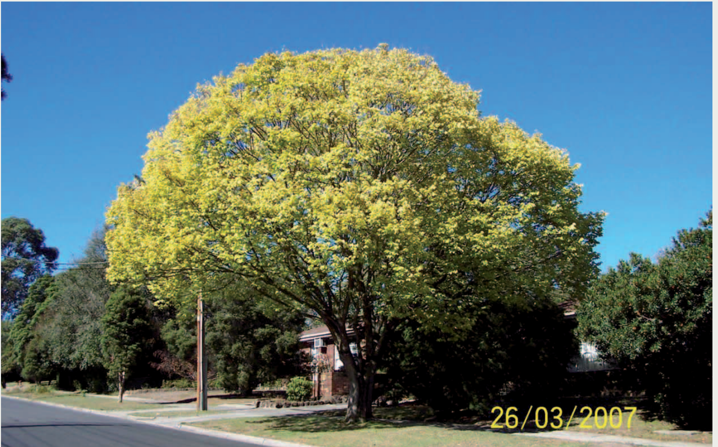
2007: Good control in the Third season, drought conditions have had an effect on canopy density.