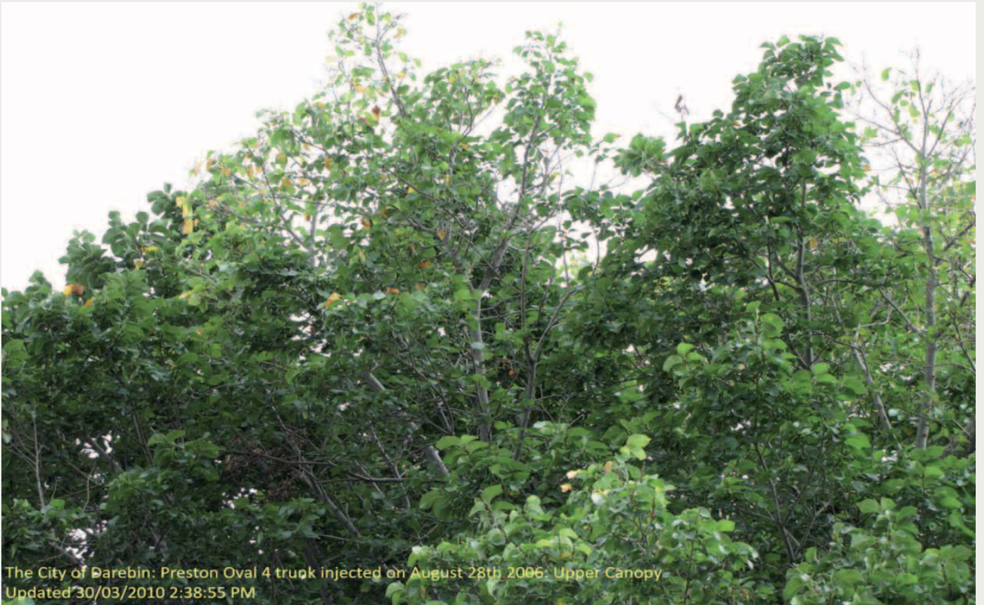
The City of Darebin: Preston Oval 4 truck injected on August 28th 2006: Upper Canopy Updated 30/03/2010 2:38:55 PM

The City of Darebin's treatment programs can now be extended out to four or more years.