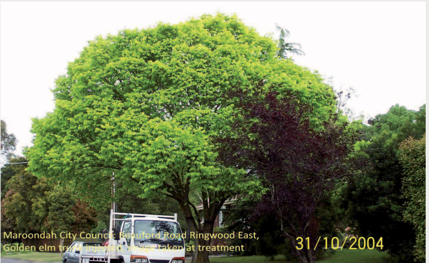
Maroondah City Council: Belford Road Ringwood East, Golden elm trunk injected, image taken at treatment

The City of Darebin's treatment programs can now be extended out to four or more years.