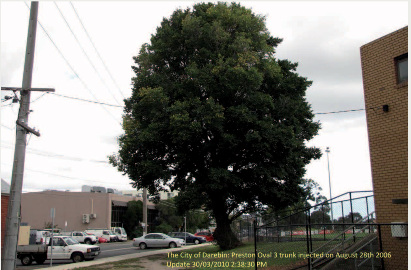
The City of Darebin: Preston Oval 3 trunk injected on August 28th 2006 Update 30/03/2010 2:38:30 PM